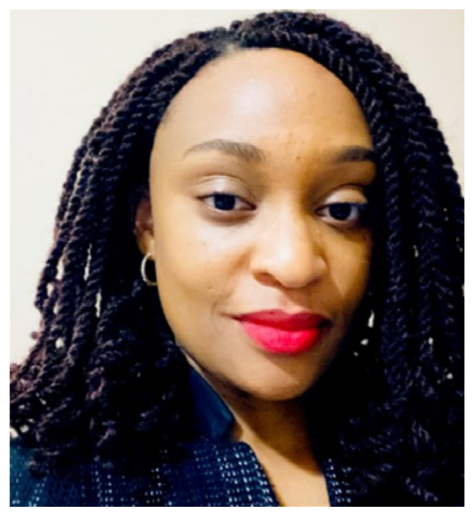
Ng'ombe: We want farmers to always emerge winners

Ng'ombe further urges farmers too consider the rainfall forecast predicted by the Meteorological Department as it provides vital information on what seed varieties to grow.