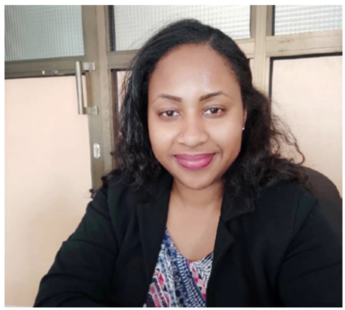
Issat: We have a number of seed varieties

"This is a differentiated product currently being offered in Malawi by our company only and the product responds to the problem of poor groundnut seed germination the country has been facing," she explains.