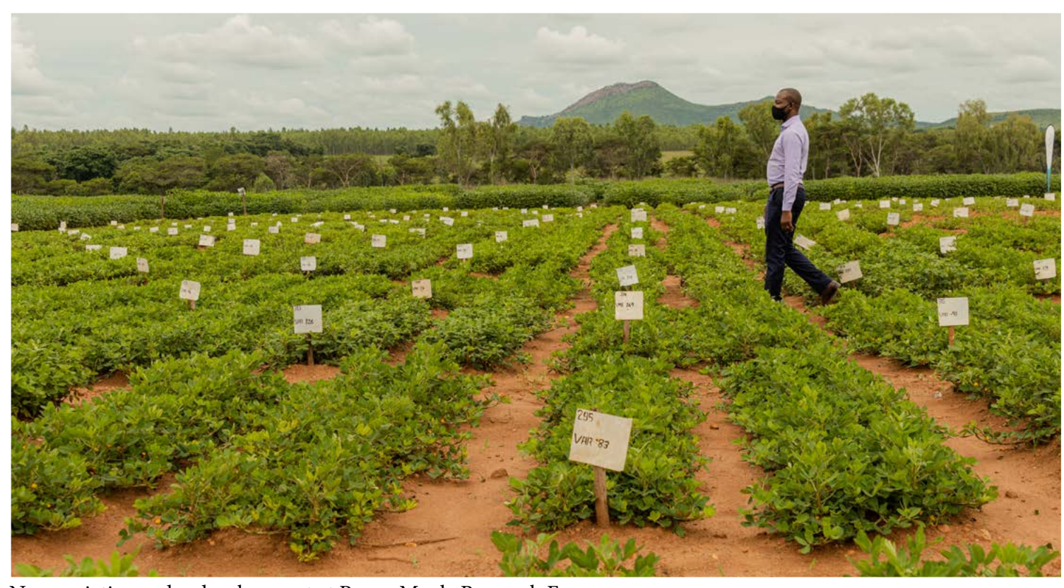
New varieties under development at Pyxus Mpale Research Farm