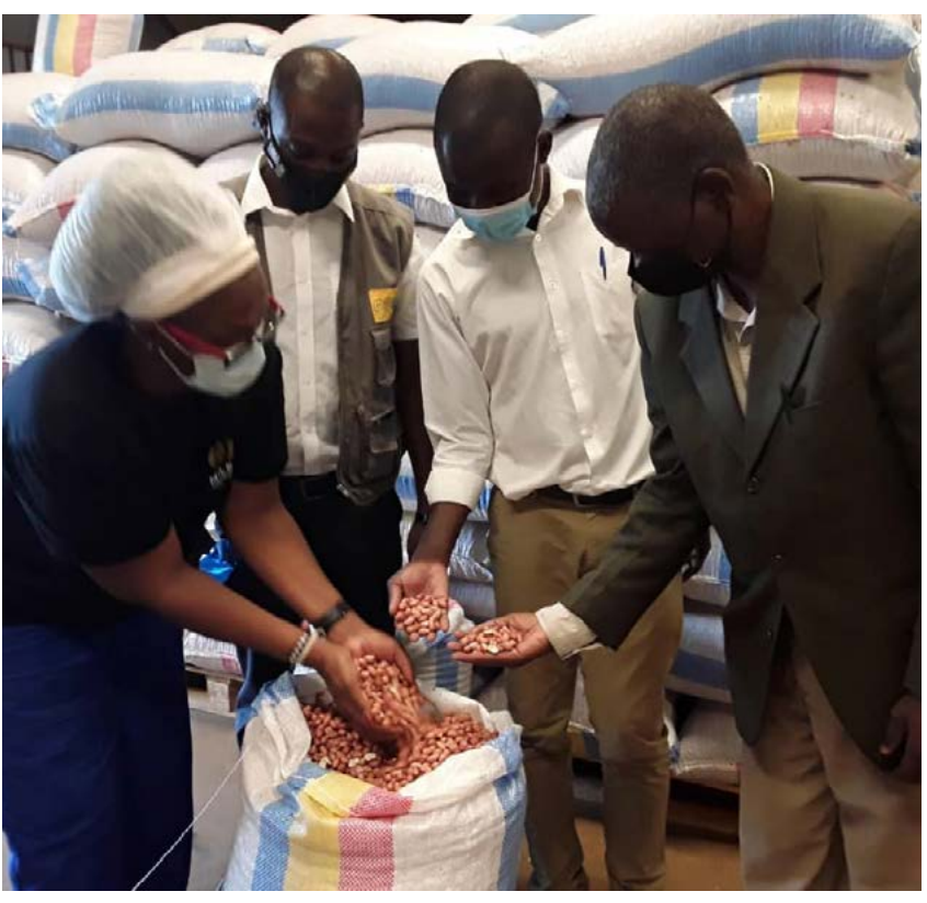
Grading of groundnuts at Milele warehouse

"The availability of companies like AISL and Pyxus is a great opportunity for farmers but there is need for promotion of good agricultural practices so that the farmers can increase their production and meet the quality and quantity demands from the companies,"